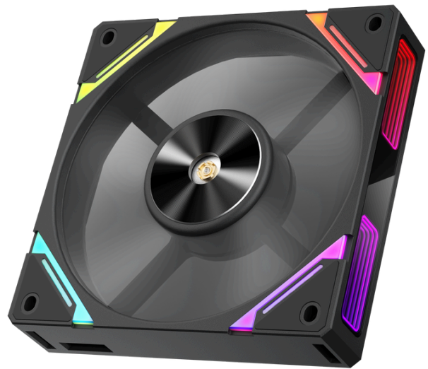
XF7 PWM + ARGB FAN