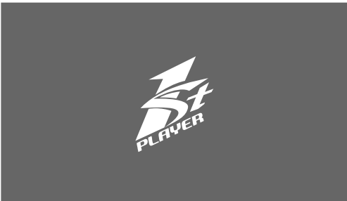
PC GAMING CASE Go6