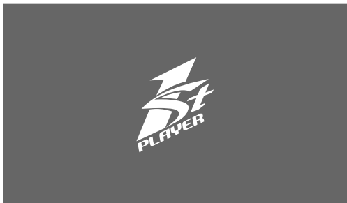
PC GAMING CASE RT7