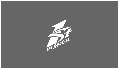
PC GAMING CASE Mi7